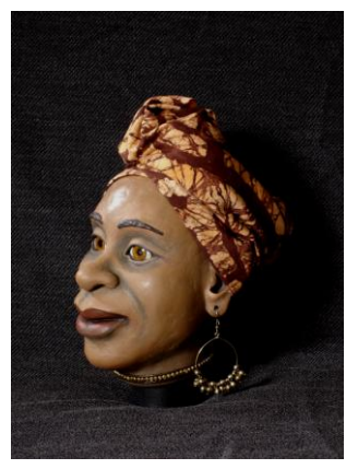
For every people used to practice manual activities. People interested or already involved in performance with puppets.